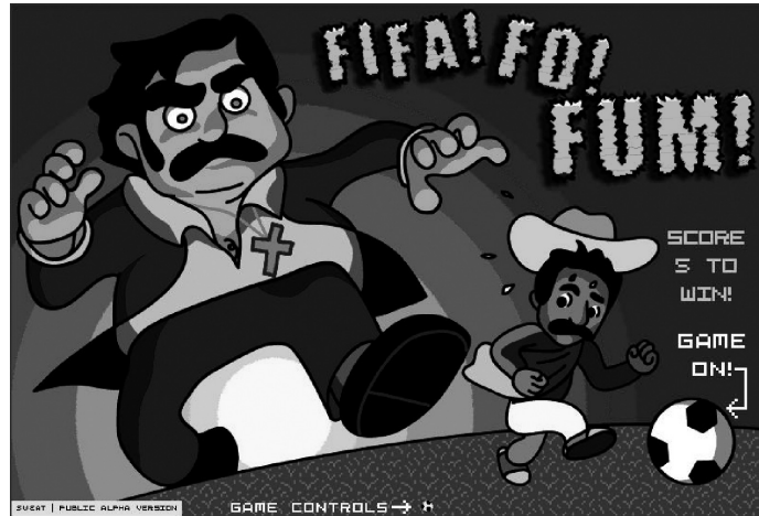
Fig. 2: Pablo, the head narco

The player is given the choice between cultivating poppies for the narcos or coffee for the federation. Poppies grow fast, give a high rate of return, and carry a high degree of risk of expropriation by the government. Coffee grows slowly, gives a low rate of return, and runs a high degree of risk of expropriation by the narcos.