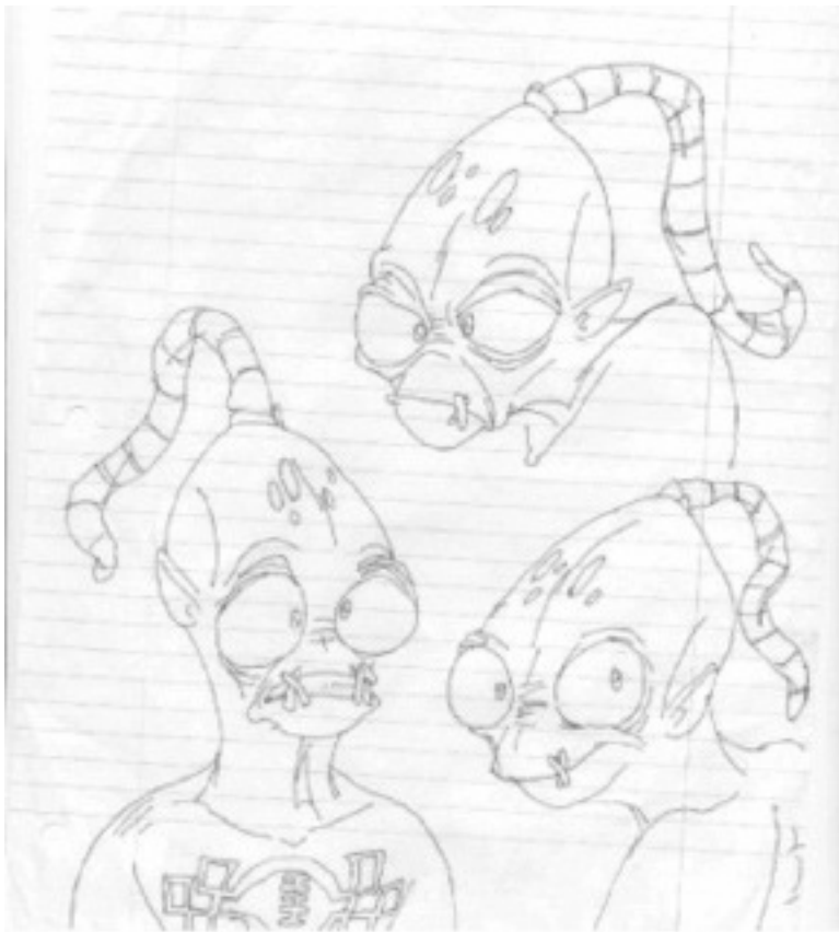
Figure 8 – ‘Abe Art’ by Dipstikk (Matt Seeger) that stimulated discussion of appropriate materials for presentation of work and the anatomical accuracy of his depiction of Abe.

It is not uncommon for fans’ critical comments to also have a direct impact on the artwork presented, in which sketches will be re-drawn or altered in line with feedback. Consistent with Bandura’s concept of collective agency, this practice most commonly occurs in fan-art in which fan-fiction characters are fashioned and realised combining the input of the fiction writers, illustrators and other contributors. Likewise, within multimodality theory the text is regarded as a “process, as unfinished business, rather than a neat, sealed object on a shelf, or in a timeless space” (Burn, 78). “Tybie_odd” provides a good example of this in his work, which he posted in the form of four character pictures titled ‘Work at Rupture Farms’. About this mini text-based role play he initially stated: “They aren’t my characters but I really liked them so I had to try and draw them, I have included a favourite quote and credit