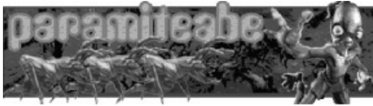
Figure 6 – Banners by Xavier, Abe Babe & Paramiteabe.