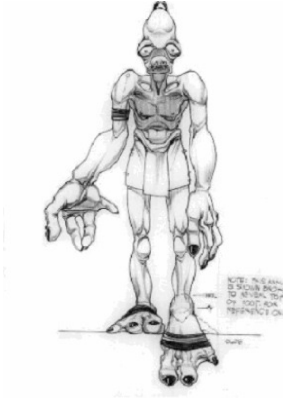
Figure 3 – Design taken from the official Oddworld website.

(in Bourdieu's sense of 'easy'), and, in general, opposed to a view of art as original, individual, based in hard-won craft skills. Behind the smooth surface of the digital aesthetic, however, all games contain a design phase rooted in traditional craft skills. Japanese games are well-known for having designs based on the elaborate paintings of their concept-artists. Oddworld is no different. The official website is at pains to emphasise the hundreds of iterations of pencil sketches of Abe, and presents some of them on the site (see Fig. 3).