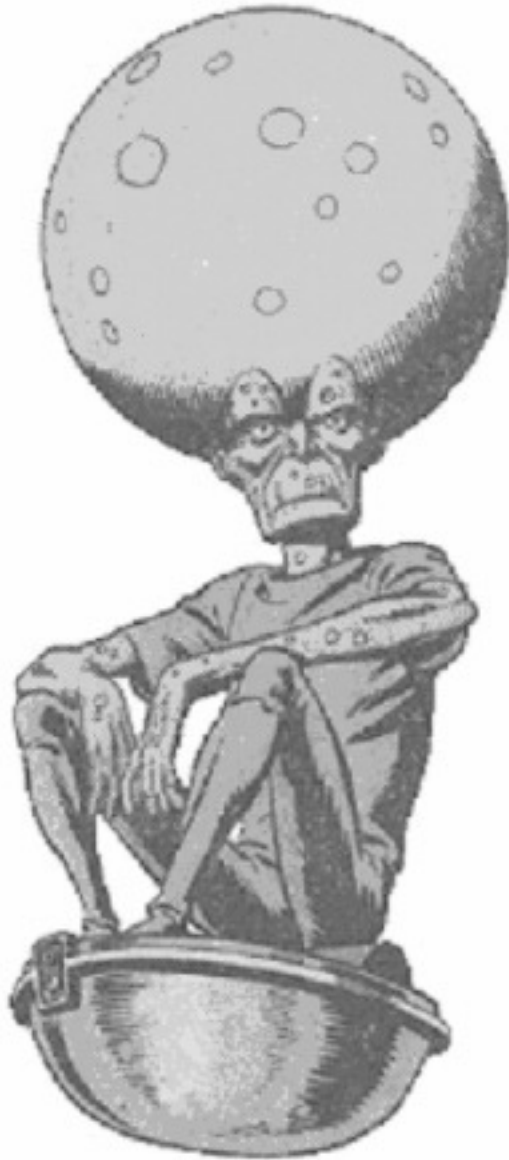
Figure 2 – The Mekon.

These meanings are also imported, with the image, into the Abe narrative. Abe also begins life as a slave, along with the Mudokons in general, and his quest is for emancipation—though through his