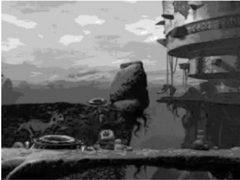
Figure 4 – Screenshot taken from Abe’s Oddysee.

As a ‘classificatory system’ (Atkinson 1999) in which understanding and meaning are constructed, the exhibitor of fan-art on the forum also explores the aesthetic concepts of Oddworld through the manipulation of different materials and processes (e.g. pencil sketches, inked illustrations, puppets, plasticine models, computer-edited montages and original art). In doing so, fans publicly refine and control their use of art tools and techniques, and evaluate their own and others’ work and the lessons they learn from Oddworld Inhabitants’ artists and designers.