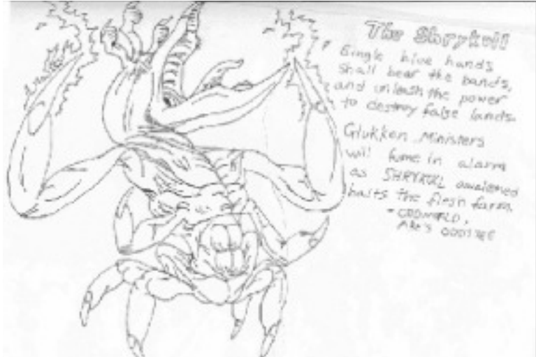
Figure 7 – Depiction of a Shrykull a powerful force that transforms Abe and permits him to defeat those who have exploited his people.