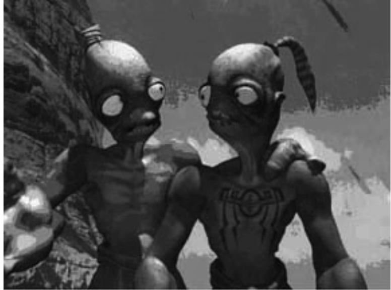
Figure 1 – Abe (right) interacts with a fellow Mudokon. Image courtesy of Oddworld Inhabitants, Inc