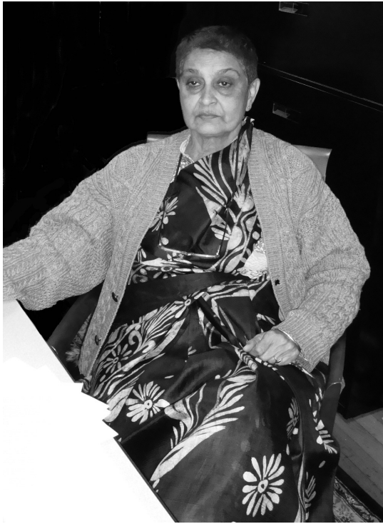
Gayatri Chakravorty Spivak Earl Hall, Columbia University, 7 Apr. 2009

Yes, in the short term, I’m absolutely for fighting, as I have indeed in my short career, fighting every time that an administration or a state stops someone for a politically unacceptable position; though if you look at what we support, you will realize that we are against bureaucratic egalitarianism. We bind academic freedom to a context because we want it free . This is why we cannot confine ourselves to only the “infringements of academic freedom.” I can’t even see them as infringements of academic “freedom,” because in each case it’s bound to a position taken by the academic who happens to have contradicted the assumptions of the more conservative side.